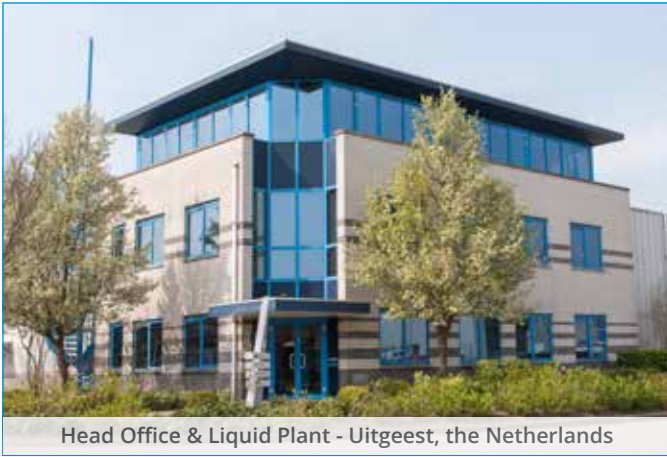
Head Office & Liquid Plant - Uitgeest, the Netherlands