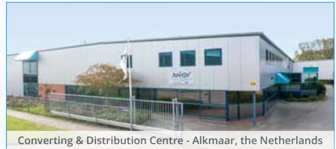
Converting & Distribution Centre - Alkmaar, the Netherlands