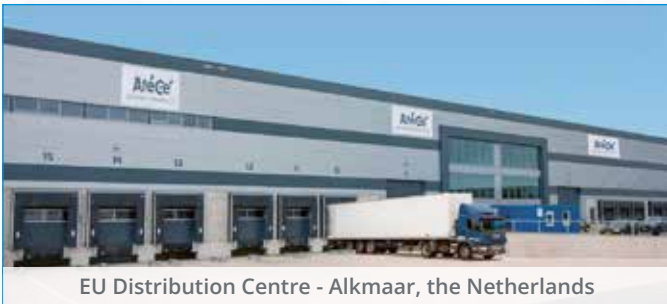
EU Distribution Centre - Alkmaar, the Netherlands

Based in the Netherlands, AtéCé Graphic Products is a leading manufacturer of a wide range of graphics consumables. AtéCé exports to more than 120 countries around the world via an extensive network of distributors.