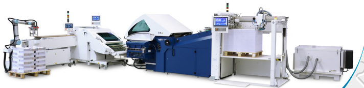
MBO K8 & Cobo-Stack